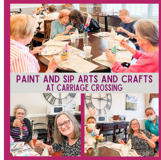
PAINT AND SIP ARTS AND CRAFTS AT CARRIAGE CROSSING