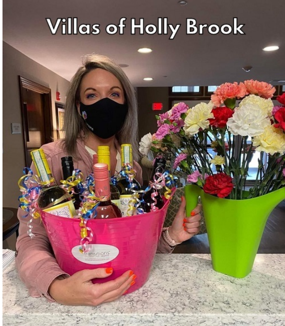
Villas of Holly Brook