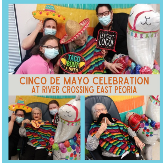
CINCO DE MAYO CELEBRATION AT RIVER CROSSING EAST PEORIA